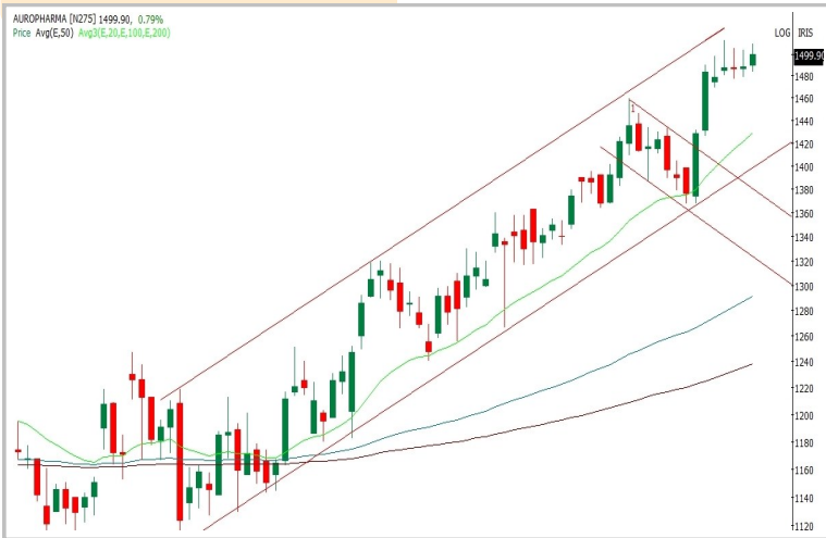
Technical Chart : Daily