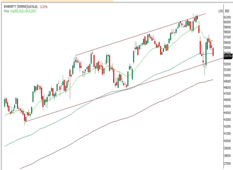
Technical Chart : Weekly