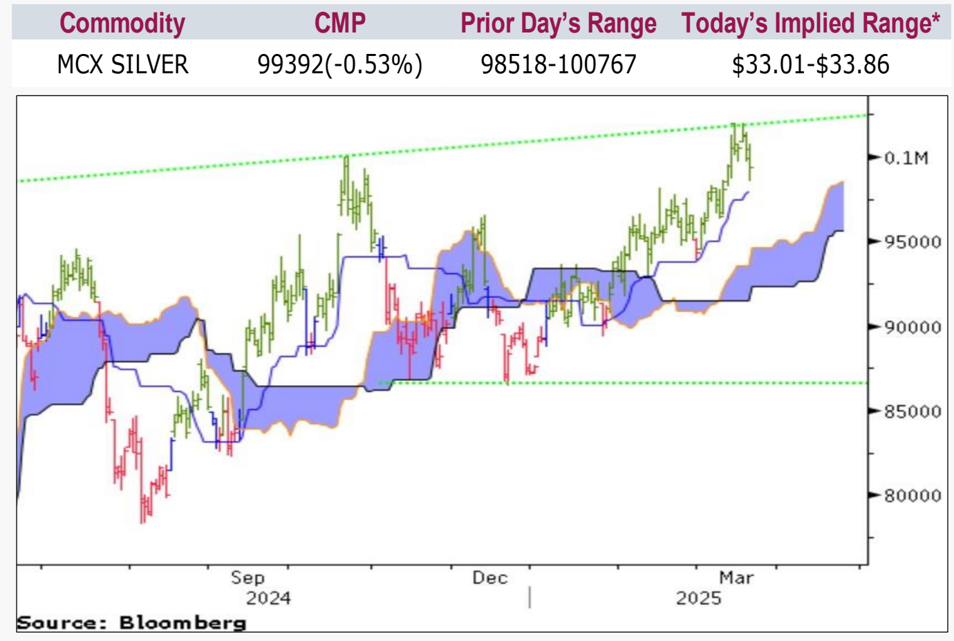
Implied range is for the Comex front-month futures