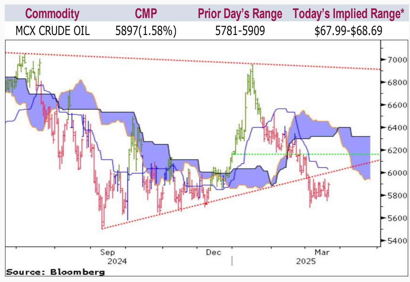
Implied range is for the Nymex front-month futures