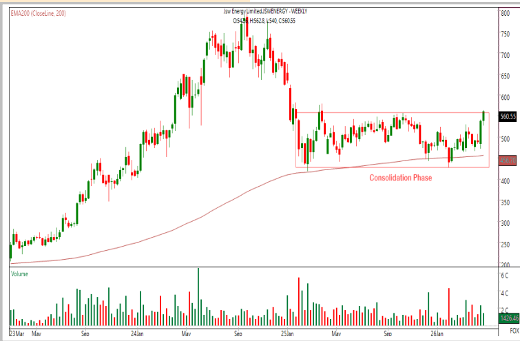
Technical Chart : Weekly