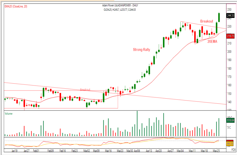
Technical Chart : Daily