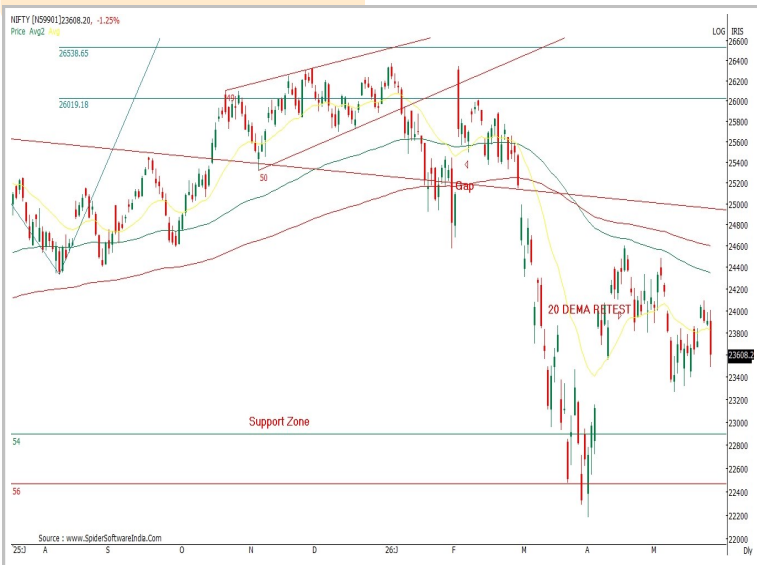
Technical Chart : Daily