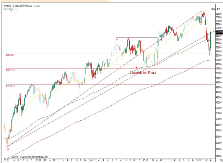
Technical Chart : Weekly