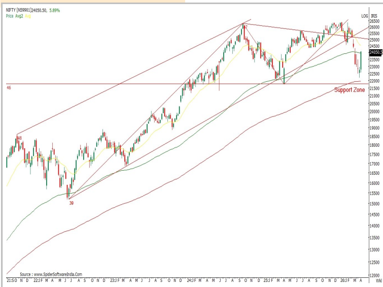
Technical Chart : Weekly