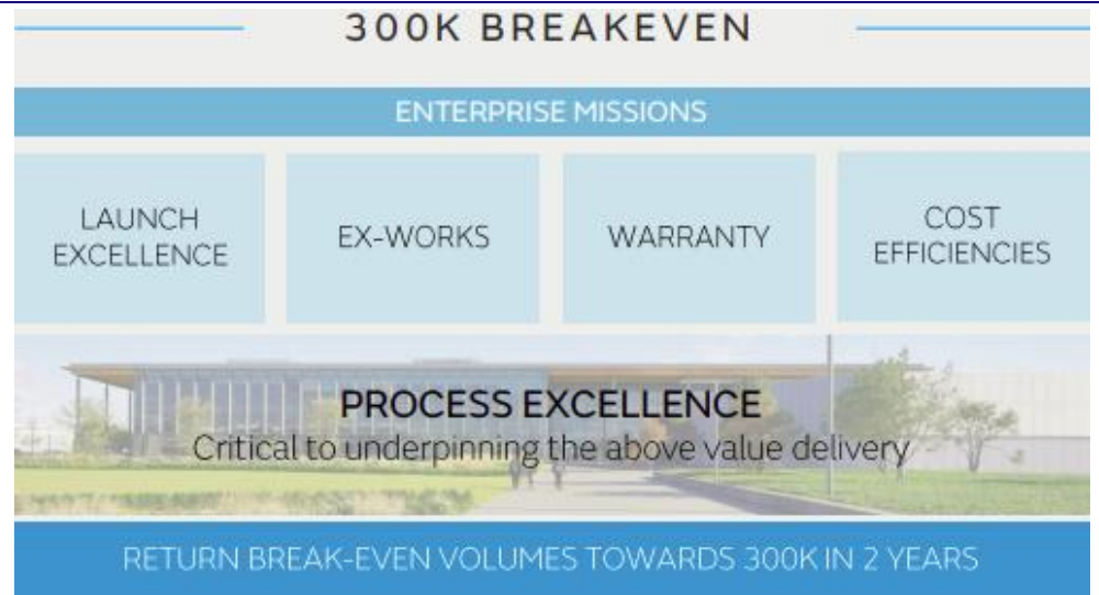
Exhibit 2: Targeting breakeven volumes of 300k units pa by FY28