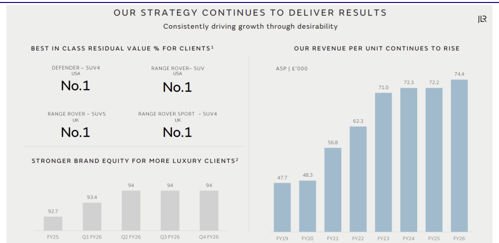
Exhibit 4: Strong brand equity and higher ASP to drive operational performance