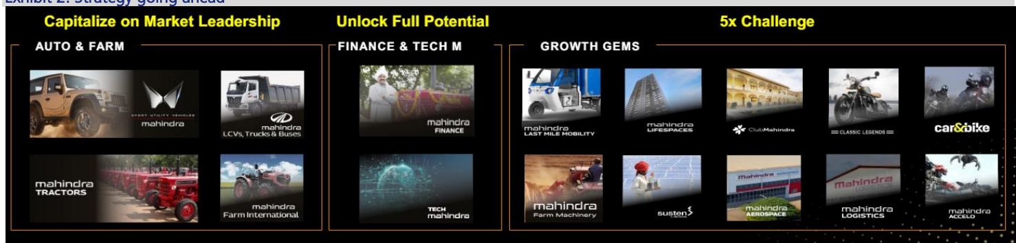
Exhibit 2. Strategy going ahead