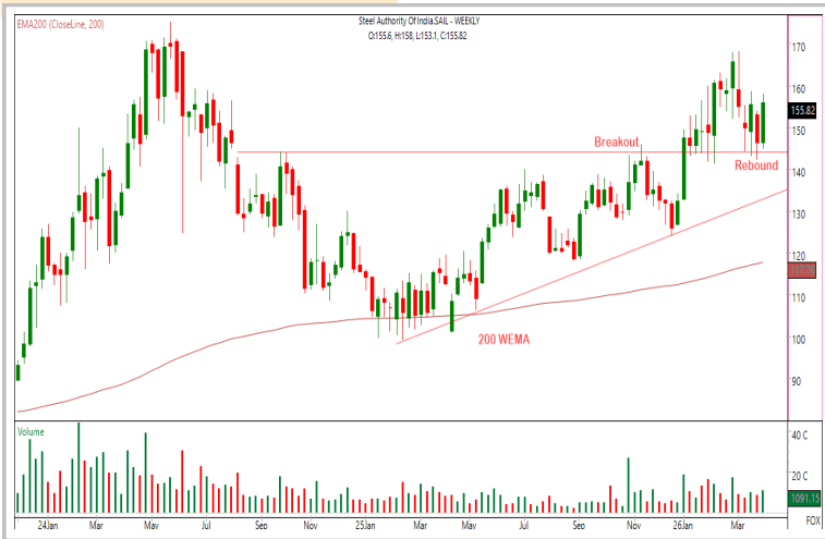
Technical Chart : Weekly