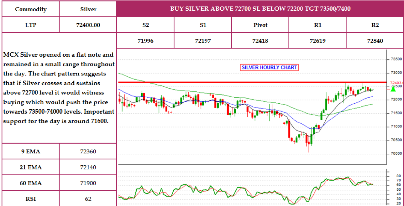
Chart for the day