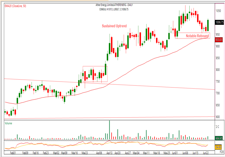
Technical Chart : Daily