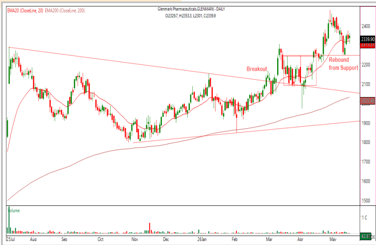
Technical Chart : Daily