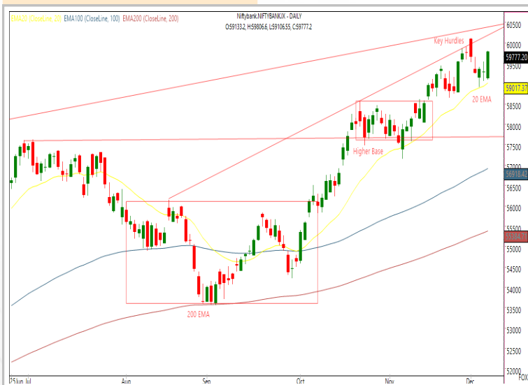
Technical Chart : Daily