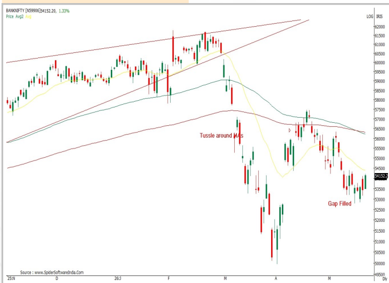
Technical Chart : Daily