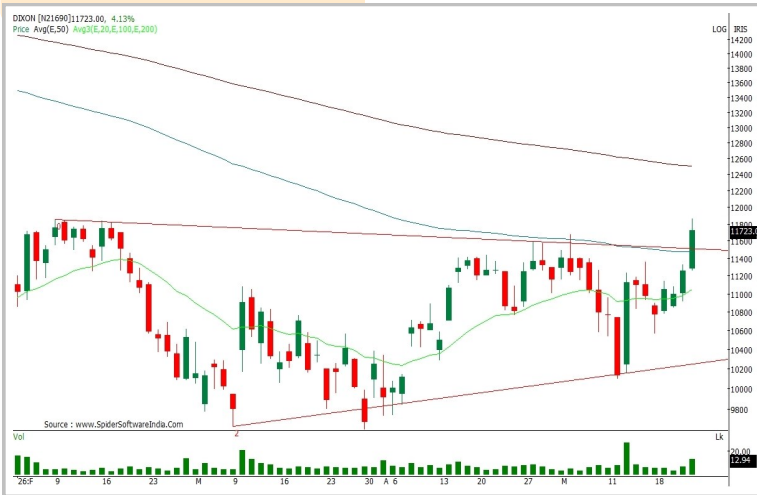
Technical Chart : Daily