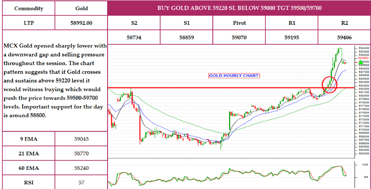
Chart for the day