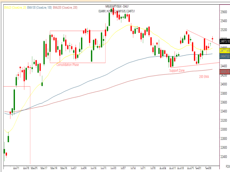
Technical Chart : Daily