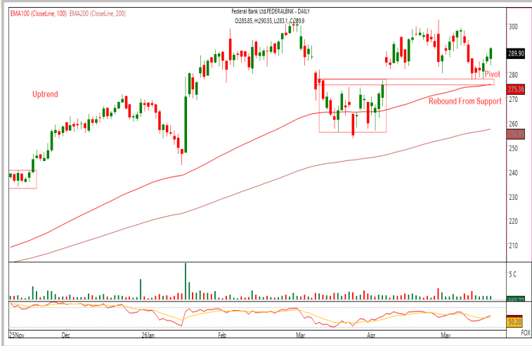
Technical Chart : Daily