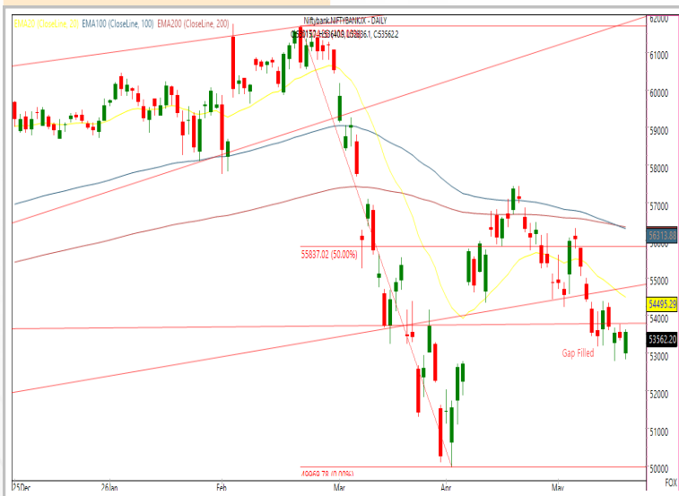
Technical Chart : Daily