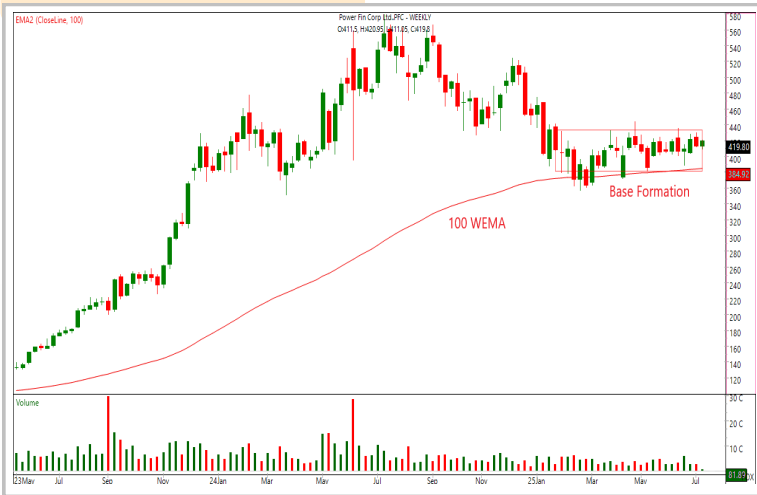
Technical Chart : Weekly