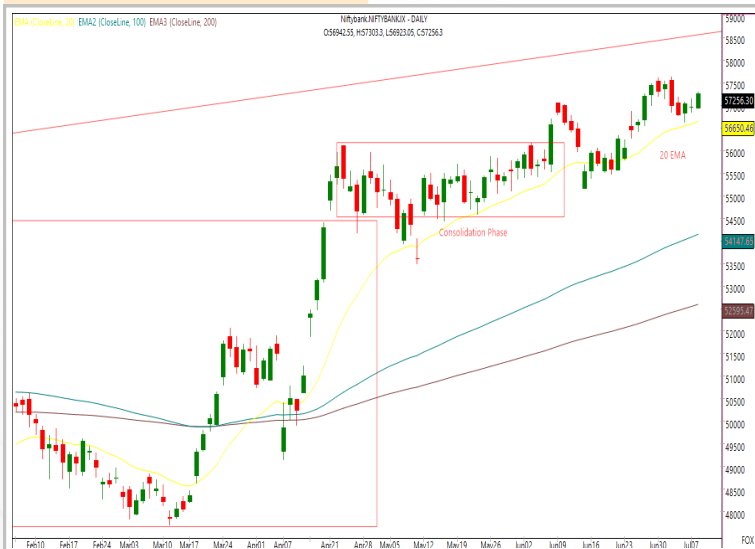
Technical Chart : Daily