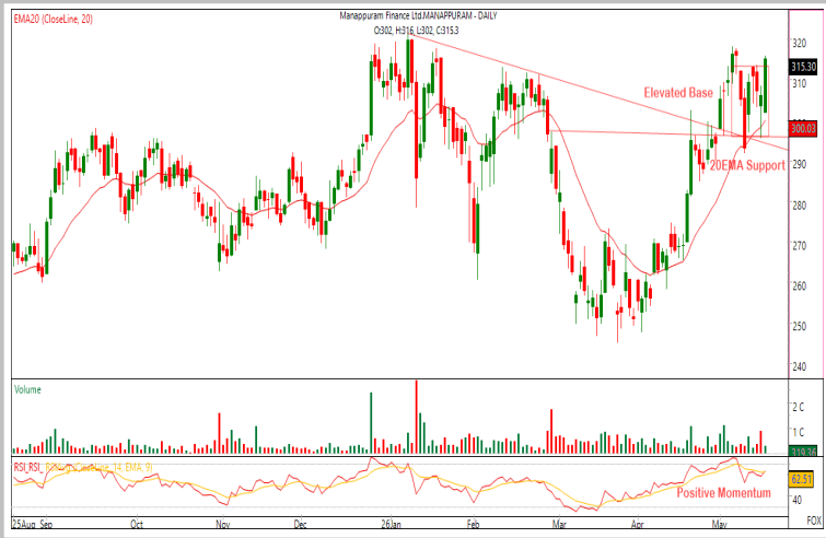
Technical Chart : Daily