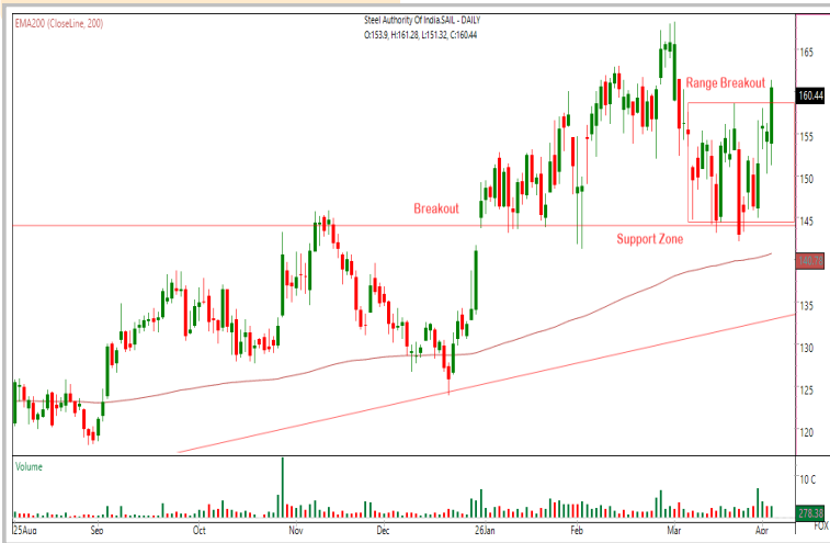
Technical Chart : Daily