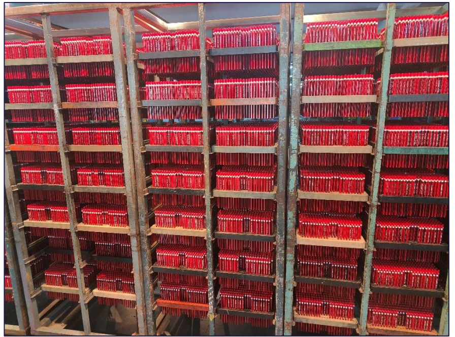
Exhibit 6: Slate showcasing finished pencil product