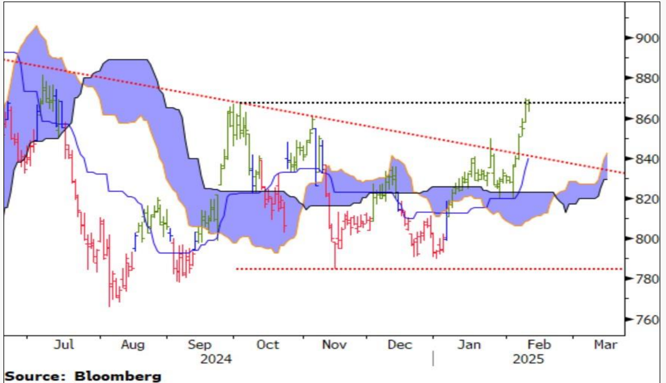
Implied range is for the Comex front-month futures