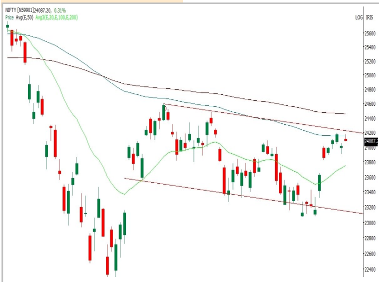
Technical Chart : Daily