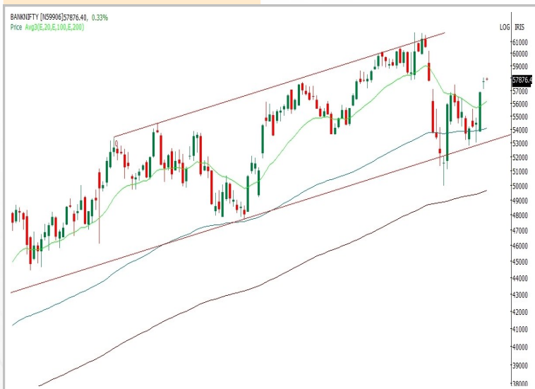
Technical Chart : Weekly