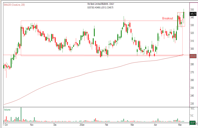
Technical Chart : Daily