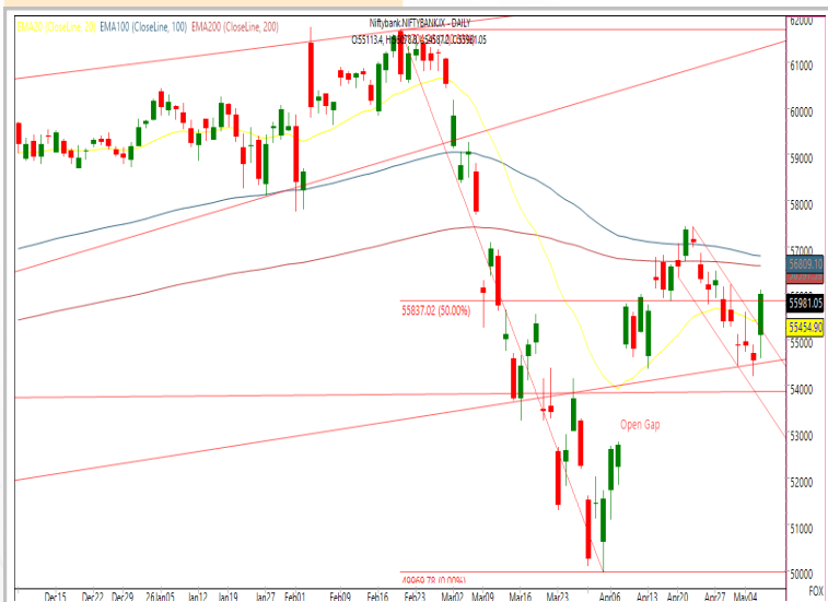
Technical Chart : Daily