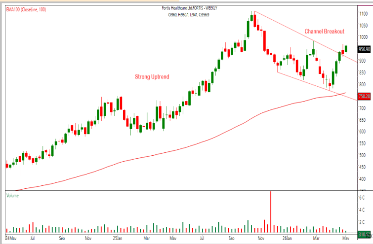
Technical Chart : Weekly