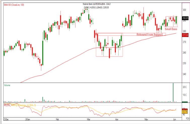
Technical Chart : Daily